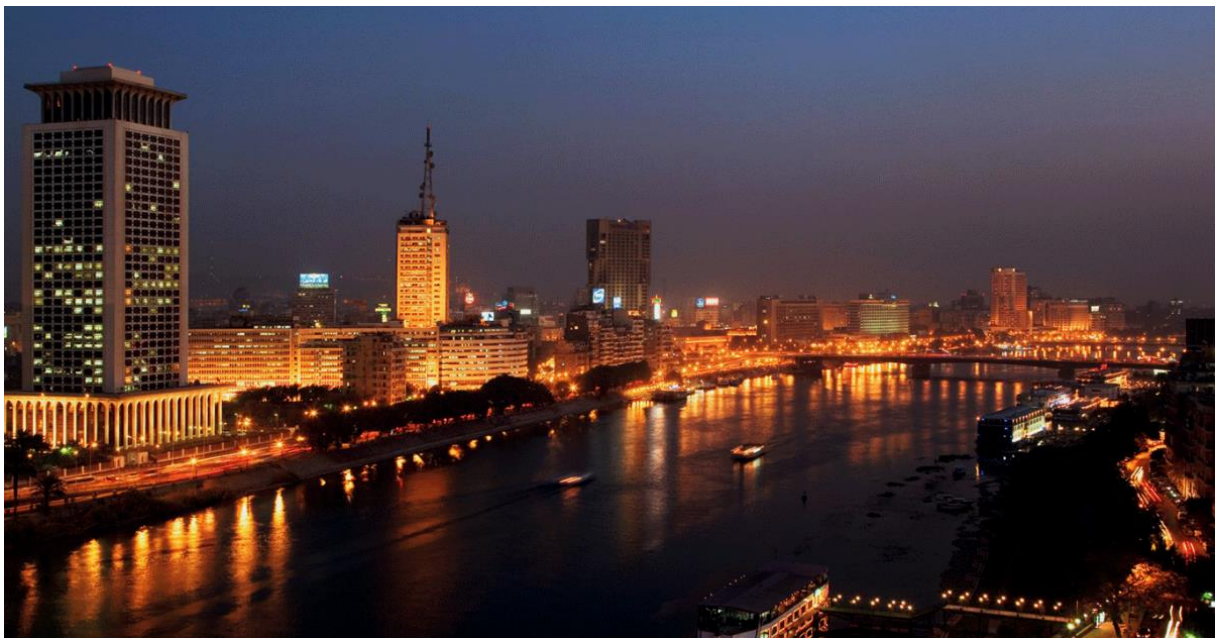
The Nile River

Amendments to this circular note will be issued as necessary and will be available at the Information Desk at the meeting venue.