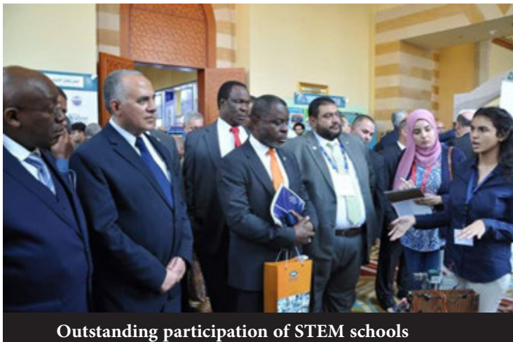
Outstanding participation of STEM schools