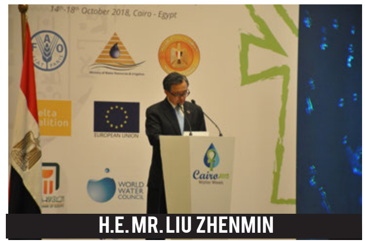
H.E. MR. LIU ZHENMIN