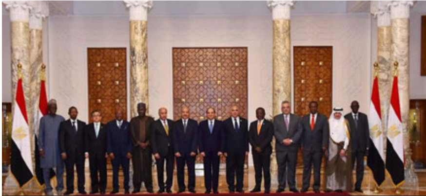
President Abdel Fattah Al Sisi met today the head of delegations of the 4th session of Islamic Conference of Ministers Responsible for Water, in the presence of Dr. Mohamed Abdel Atti, Minister of Water Resources and Irrigation.

Under the umbrella of the first Cairo Water Week, the 4th session of the Islamic Conference of Ministers Responsible for Water was held this year as a high-level event in the 1st CWW. The conference started today by senior officials meeting with the presence of more than thirty delegations from various OIC member States. The meeting included presentations on the capacity and needs of Organization of Islamic Countries (OIC) Member States in the area of capacity-building.